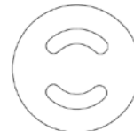
ITW BRANDS - DUO-FAST